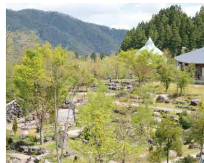
Hakusan-Roku Theme Park