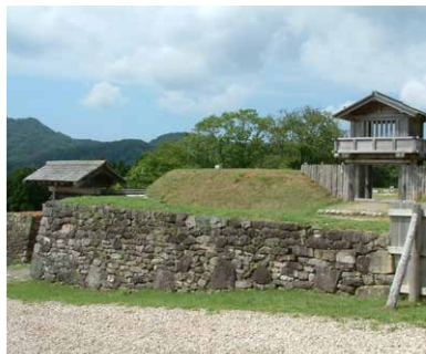
Torigoe Castle Ruins