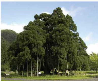
Oboke-sugi Cedar Tree