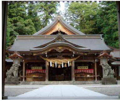
Shirayama Hime Shrine