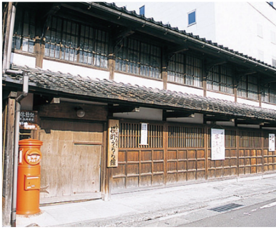
Yokomachi Urarakan Free Resthouse