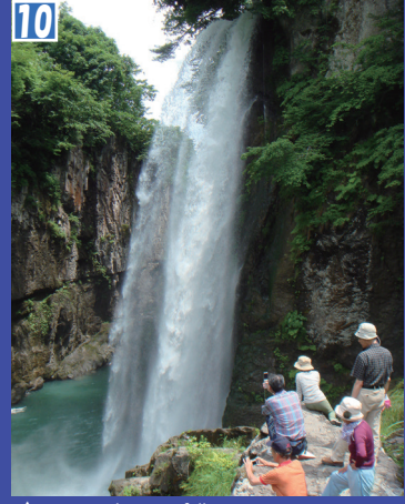
▲Watagataki Waterfall View this roughly 32m high waterfall by descending deep into the gorge.

Located in the mid-section of the Tedori River, this 20 to 30m deep gorge runs for approximately 8km. The Tedori River carved deeply into the 10 to 20 million year old volcanic base rock.